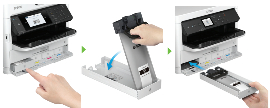
Designed for easy replacement of ink packs