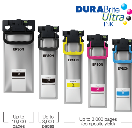
Enjoy greater cost-savings with these high-volume ink packs

In addition, Epson's DURABrite™ Ultra ink delivers laser-like quality prints that are water- and smudge-resistant.